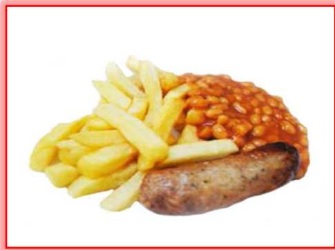
Sausage, Potato Wedges & Beans