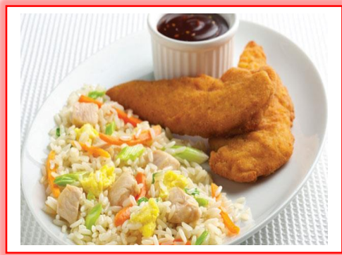
Breaded Chicken with Savoury Rice & Vegetables