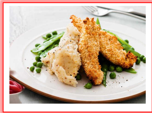
Chicken Goujons with Mash, Peas & Sweetcorn