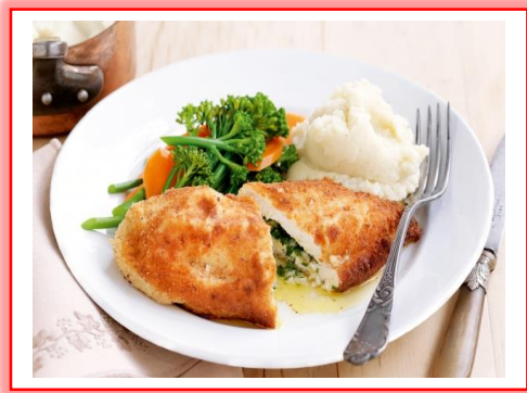
Chicken Kiev with Mashed Potato