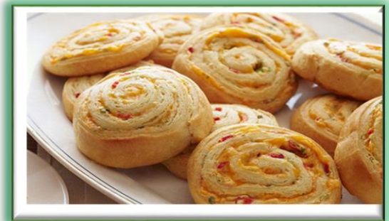
Cheese Wheels with Potato Wedges and Baked Beans