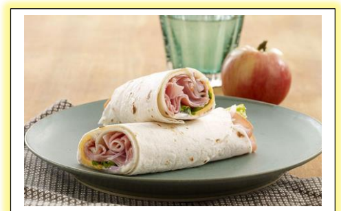
Cheese, Gammon Ham or Chicken Mayonnaise Wraps