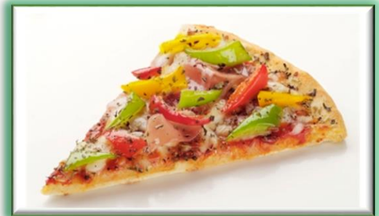
Mixed Pepper Pizza