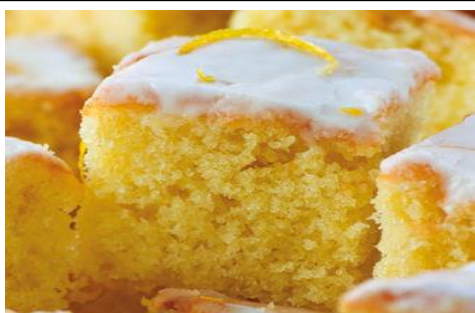
Lemon Drizzle Cake