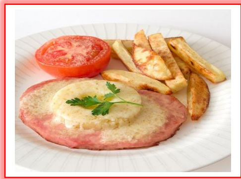
Gammon Ham and Pineapple with Potato Wedges