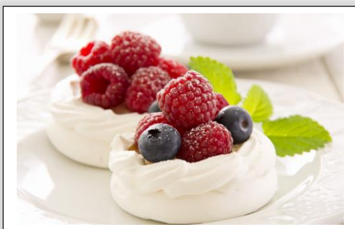
Fruit filled meringue nest