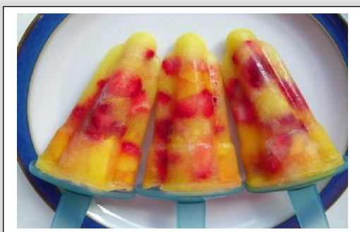
Yummy Fruit Lollies