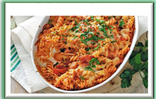
Tomato Pasta Bake with Garlic Bread