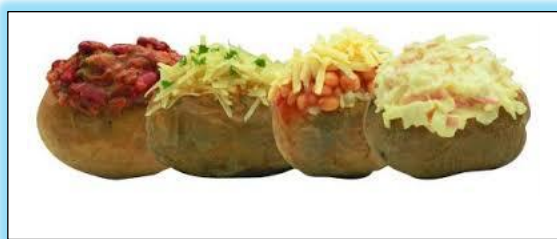
Jacket Potato with