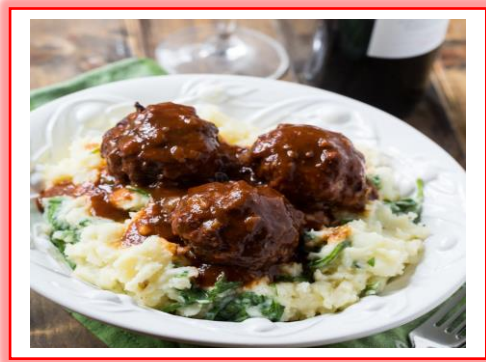
Meatballs with Mashed Potato & Gravy