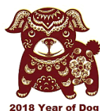
2018 Year of Dog

We will advertise the winners in the newsletter - watch this space!!